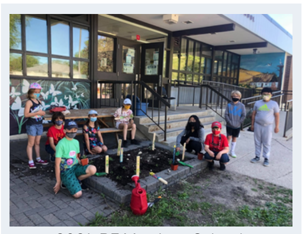
2021, RF Morrison School

The pressures facing the world's ecosystems such as colonization, increased consumption, and climate change simultaneously threaten Indigenous cultures, languages, and ways of life.