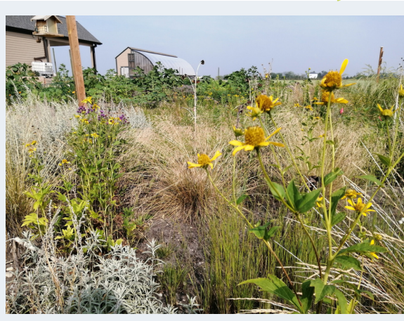
Ozhaawashkwaa Animikii-Bineshi Aki Onji Kinimaagae' Inun