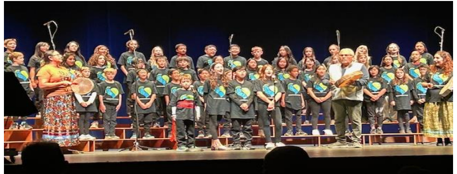
Divisional Day Performance at Centennial Concert Hall