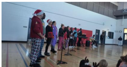
Staff singing at the holiday sing at the holiday sing-along assembly