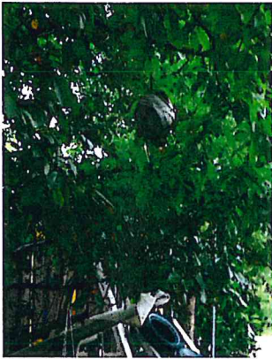
This wasp nest was found in Owen K.'s backyard.

Bus evacuation will be practiced twice yearly. Our first bus evacuation is scheduled for September 17th. All students are required to participate in bus evacuation. There is no food or drink to be consumed on the buses.